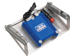
IN-TRANSIT DC BATTERY CHARGER P/N 930114

Holds product in place securely - available in 56" and 100" lengths.