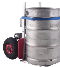
STRAP P/N 930006/930007

Holds product in place securely - available in 56" and 100" lengths.