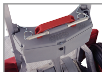
BATTERY SECURING CLIP KIT P/N 930145

Battery Securing Clip accessory helps hold the battery firmly in place even in high impact situations.